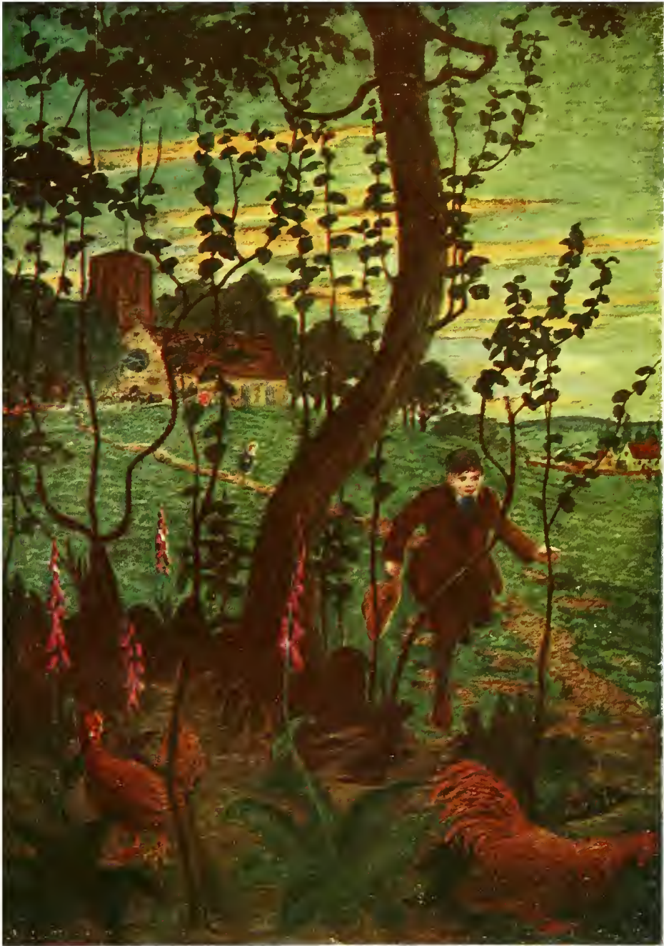
" EDWARD LED THE RACE HOME AT A SPEED WHICH ONE OF BAL- LANTYNE'S HEROES MIGHT HAVE EQUALLED BUT NEVER SURPASSED "